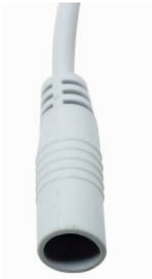
Input DC female: 5.5 x 2.1mm