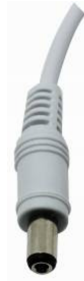
Output DC male: 5.5 x 2.1mm